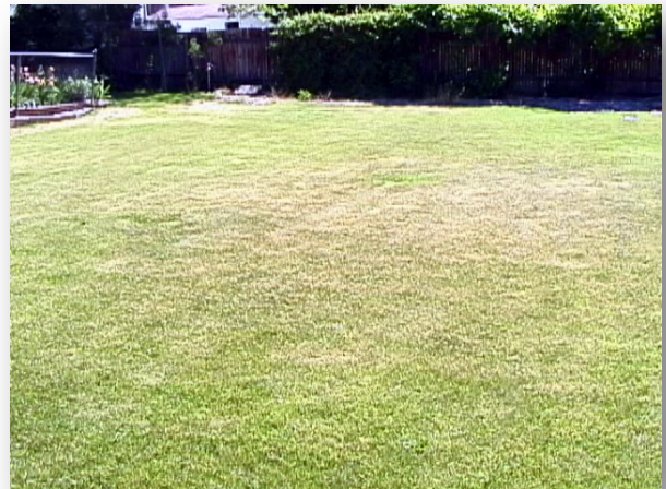
Figure 2. A weed free, summer dormant KBG lawn. Public objection to summer dormant KBG is that so many are simply no maintenance yards becoming the neighborhood weed patch.

Note: the term "ET" stands for evapotranspiration which is an actual measurement of the water use of the lawn (or crop) based on crop growth, temperature, wind, humidity, and solar radiation.