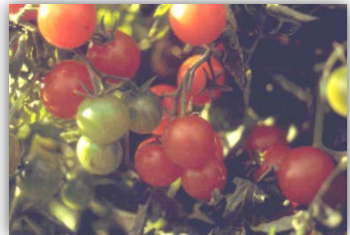
Figure 1. Sweet 100 is the most popular home garden cherry-type tomato. On a large vine, it produces hundreds of sweet, cherry sized fruits with very tender skins.

Cherry and the new grape-type tomatoes are popular for salads and snacking. Many, but not all, have small size vines suitable for container gardening. [Figure 1]