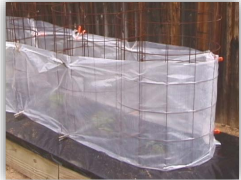
Figure 5. Wrapping the tomato cage with plastic or newspapers protects tender plants from cold winds.

Single pole trellis – Some gardeners prefer to trellis tomatoes on a single pole or stake. To do this, prune plants to a single trunk by removing all side shoots. This requires constant removal of side shoots.