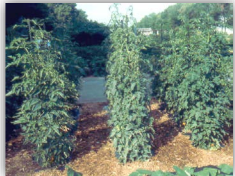
Figure 6. Tomatoes trellised to a single pole.

Fan trellis – Another method, which produces larger fruit, is to trellis to a three-trunk, fan shape, removing all other side shoots. This requires a sturdy frame to support the weight of the vine and fruit.