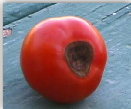
Figure 9. Blossom end rot on tomato is caused by water imbalance between the fruit and soil. The soil could be too wet, too dry, or root could be cut by cultivation. It could be aggravated by soil compaction and poor soil preparation.