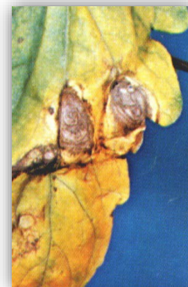
Figure 8. Early blight leaf spots

Another disease, tobacco mosaic virus (TMV) can readily spread from tobacco smoke residues on the hands and clothing to tomatoes. Prevent TMV infections by washing hands after smoking or handling tobacco products.