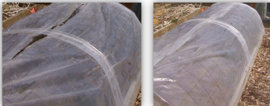
Figure 5. Left: Cover must be opened at least a slit to prevent over-heating. Right: Cold frame pictured closed for a cold night.

On cool days, open the top a crack to prevent excessive heat build-up. On a warm day, the plastic can be slid down the side, ventilating and providing crops exposure to the outdoors. On freezing nights, close the cover completely. On warm nights, the covers may be left open a crack. On stormy days with full cloud cover and no direct sun, the cover may remain closed. [Figure 5]