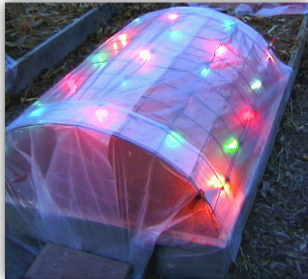
Figure 7. Cold frame with Christmas tree lights for additional warmth.

Space blanket with Christmas tree lights – For the gardener really wanting to extend the growing season, try Christmas lights plus a space blanket. One 25 light string of C-7 (mid-size) Christmas lights per frame unit (four feet wide by five feet long) with a space blanket on top gave 18°F to over 30°F frost protection in Fort Collins trials.