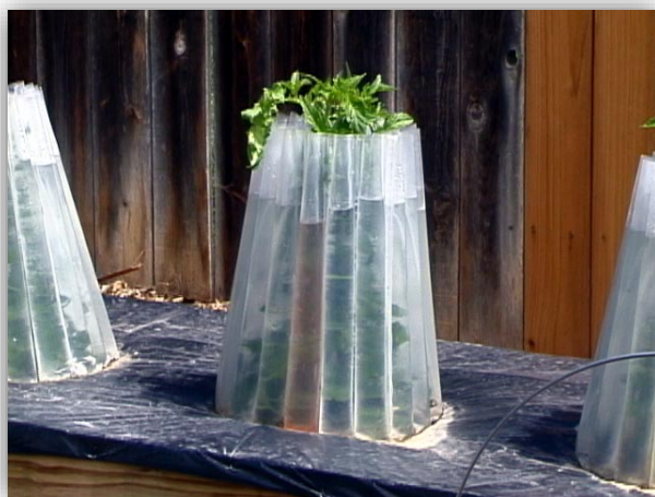
Figure 8. Tomato in Wall-of-Water. Notice use of black plastic mulch to warm the soil, another limiting factor of early production. Also, note the plant has grown beyond the device and is now less protected from frost.

Authors: David Whiting (CSU Extension, retired), with Carol O'Meara (CSU Extension, Boulder County), and Carl Wilson (CSU Extension, retired).