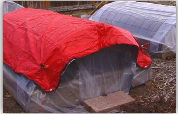
Figure 6. Aluminum space blanket covering a cold frame for extra protection on cold nights.