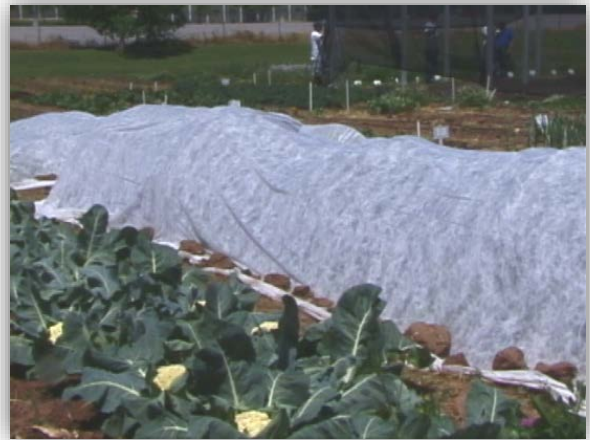
Figure 2. Floating row cover on broccoli and cabbage, protecting crops from cabbageworms moths.

Floating row covers are popular in commercial vegetable production where crops planted in large blocks are easily covered with row covers. Many brands and fabric types are commercially available.