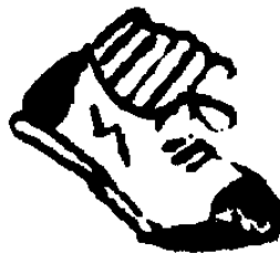
Figure 1. Foot traffic in the garden bed is a major source of compaction. The impact of raindrops and sprinkler irrigation also compacts fine-textured soils.

Soil compaction is difficult to correct, thus efforts should be directed at preventing compaction. Soils generally become compacted during home construction. Foot traffic on moist soils is another primary compaction force in the home landscape. The impact of falling raindrops and sprinkler irrigation also compacts the surface of fine-textured clayey soils. [Figure 1]