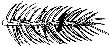
Figure 2. Pruning spruce and fir back to a side bud or side branch will encourage growth of side branches.

On young trees, pruning is useful in situations where bushier new growth is desired. Since these species produce some side buds, branch tips can be removed encouraging side bud growth. Prune late winter or early spring. [Figure 2]