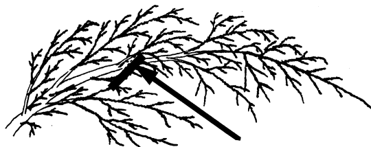
Figure 4. Pruning junipers and arborvitae back to a side shoot hides the pruning cut.

The best pruning method is to cut individual branches back to an upward growing side branch. This method of pruning is time consuming, but keeps the plant looking young and natural. [Figure 4]